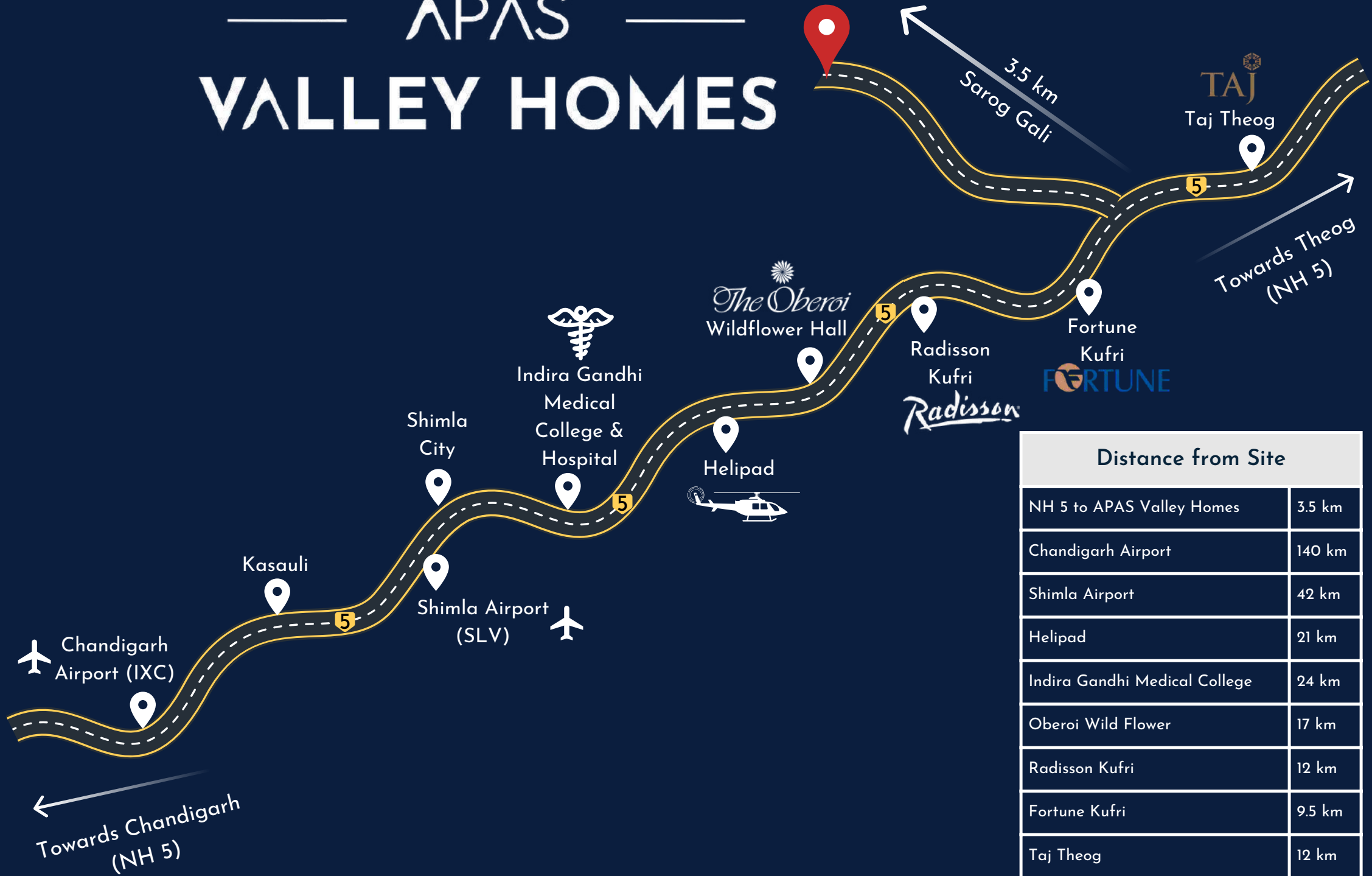
Distance from Site