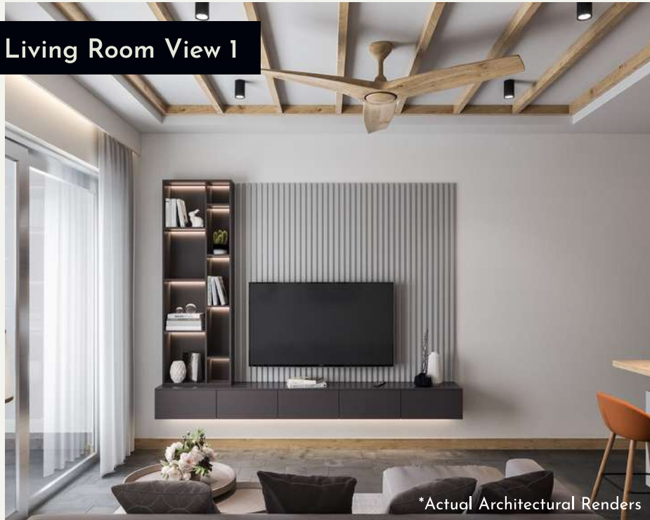
Living Room View 1