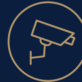
24x7 Security (CCTV & Intercom)