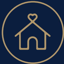
Rental Management Services