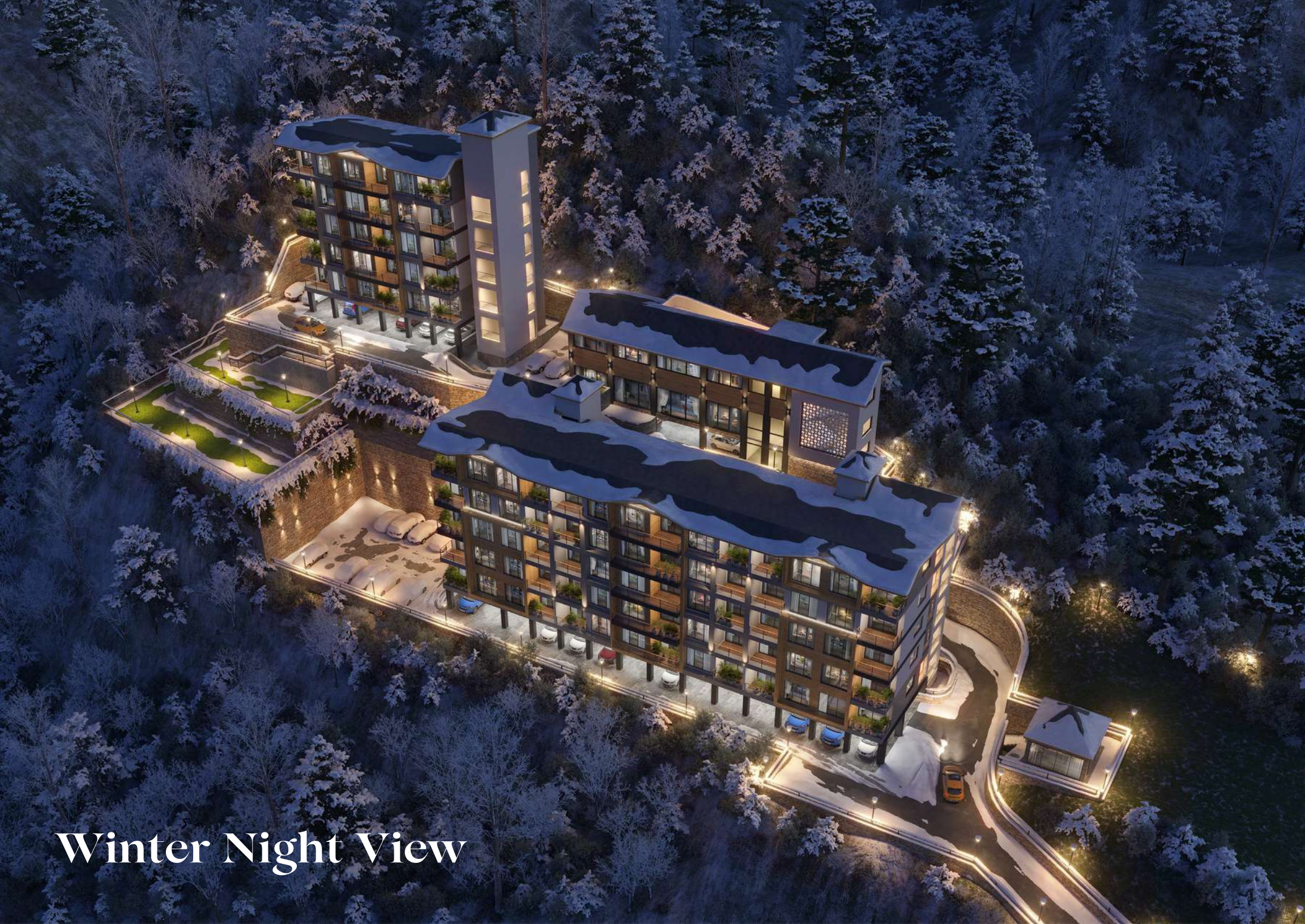
Winter Night View