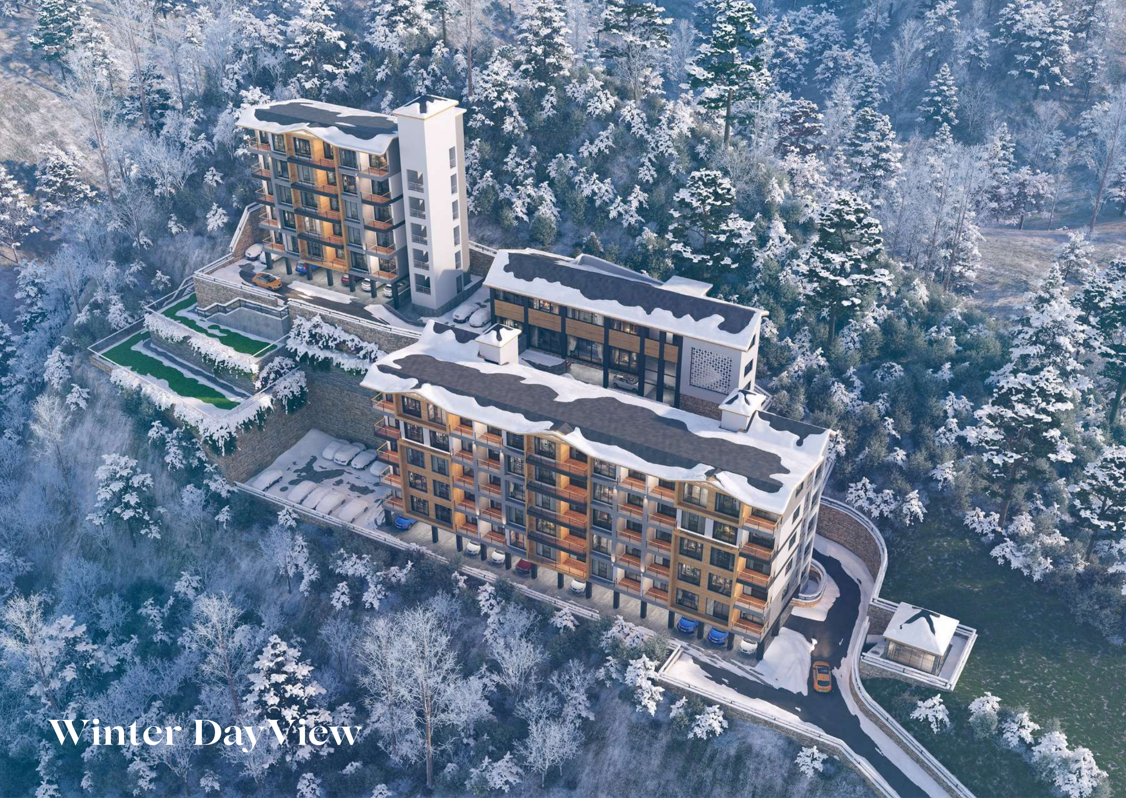
Winter Day View