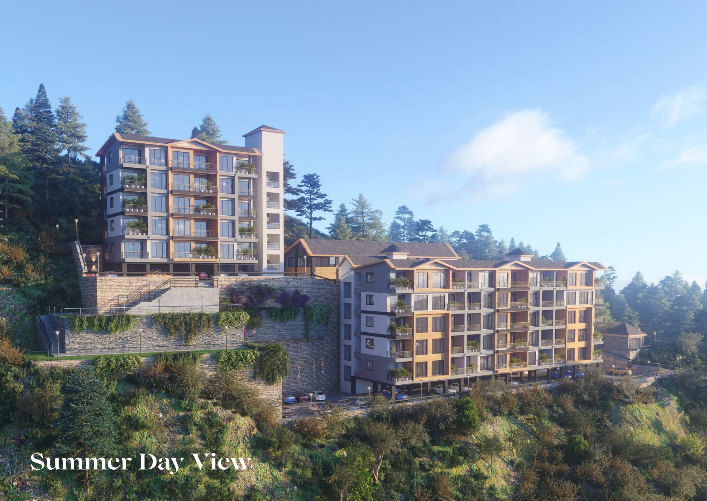
Summer Day View