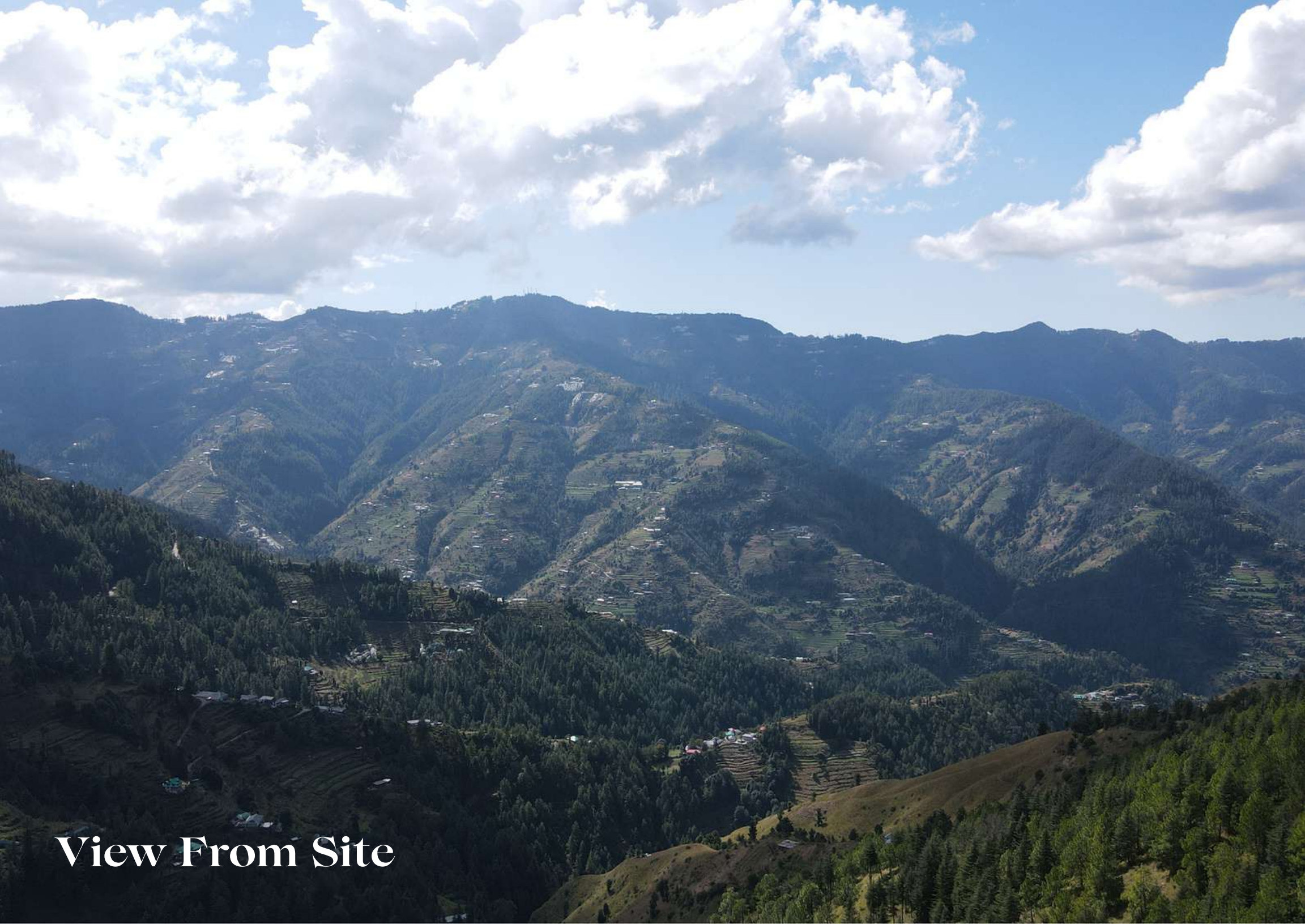
View From Site