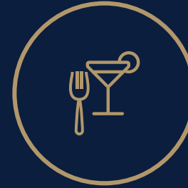
Bar & Restaurant