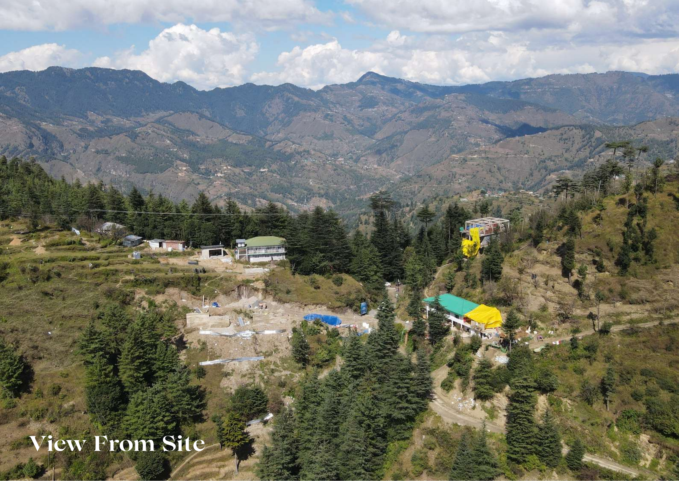
View From Site